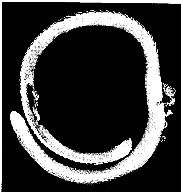
FIG. 1. X-ray from ventral surface of specimen of Gegeneophis ramaswamii Taylor showing a scollecophidian snake, Ramphotyphlops brahminus (Daudin), inside it. The outline of the snake lies beyond the body of the caecilian because a ventral incision in the body wall resulted in the protrusion of viscera. Total length of the caecilian is 290 mm.

Sarasin & Sarasin (1887-1890) reported that species of Ichthyophis eat small burrowing scollecophidian snakes, and Greeff (1884: 18) reported discovering a small scollecophidian in the gut of a Schistometopum thomense Barboza du Bocage from the island of Sao Tomé. Here we report and discuss two instances of burrowing scollecophidian snakes in the diets of two south Asian caecilians.